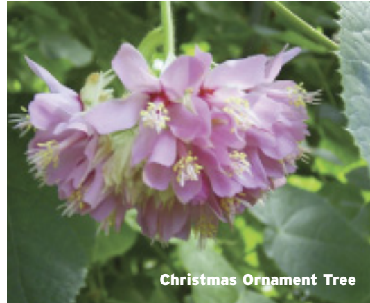
Christmas Ornament Tree

If you have enjoyed these light displays and our beautiful gardens, you can help us continue this yearly event by your donation to the Florida Botanical Gardens Foundation, 12520 Ulmerton Road, Largo, FL 33774 or call 727-582-2205 to get more donation information.